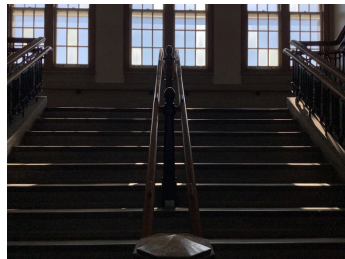
Tone Composition (Parshawn Henton--7th grade)